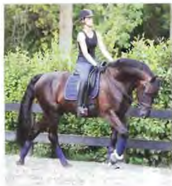
Doringcourt has a fantastic walk, and maintains his rhythm perfectly in both the collected and extended gaits