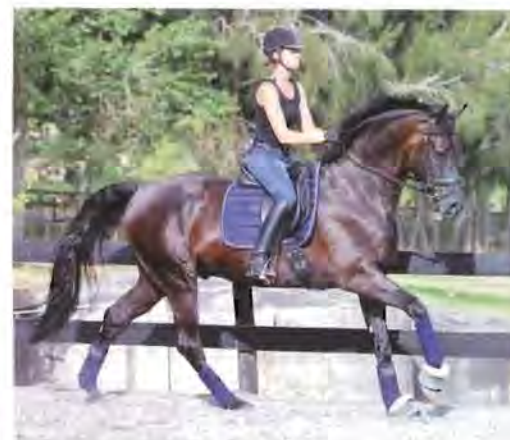
Doringcourt doesn't put a hoof wrong – a lovely canter to finish the lesson

transitions within the shoulder-in, which works on engagement and the strengthening of the hind leg.