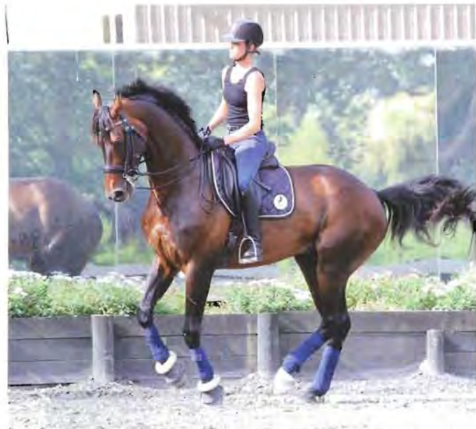
Riding travers on a circle is important preparation for the canter