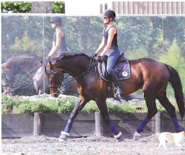
A happy trot stretch to finish