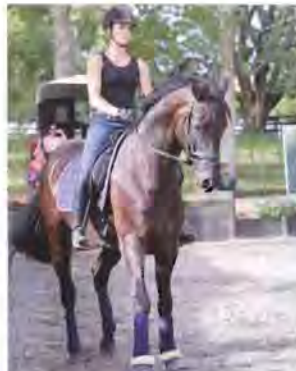
Riding trot-walk-trot in shoulder-in teaches the rider to keep the hocks stepping under in the downward transitions.