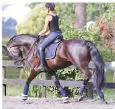
Warming up in a soft and low frame, Doringcourt is still in balance