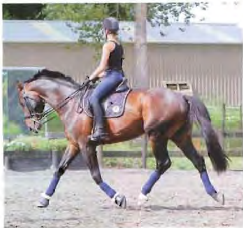
Warming up in trot, Limonit is much happier than he used to be in the double bridle and working positively right from the start